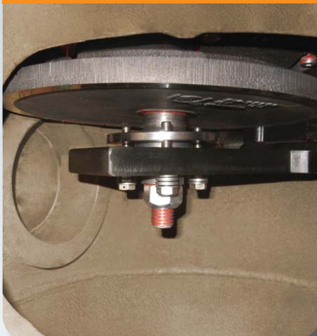
New Ball Pivot and Lever