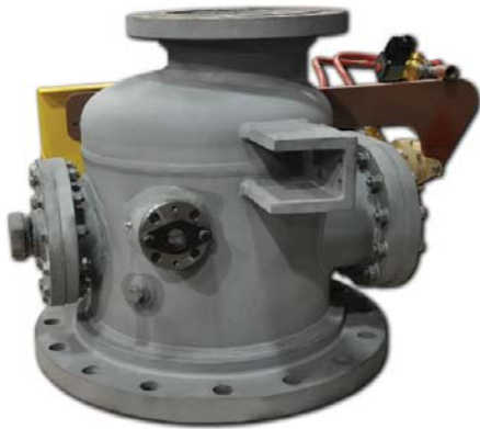
DEPAC ® Inlet Valve

The United Conveyor Corporation (UCC) DEPAC ® Inlet Valve is designed for vessel isolation service in high pressure pneumatic conveying applications of abrasive material such as dry ash. UCC has re-engineered this valve for improved sealing performance, extended service life, greater reliability and ease of maintenance over alternative valves. The DEPAC Inlet Valve comes fully assembled and can be shipped pre-piped to reduce field assembly and installation costs. Retrofit upgrade kits are in-stock and available for fast delivery.